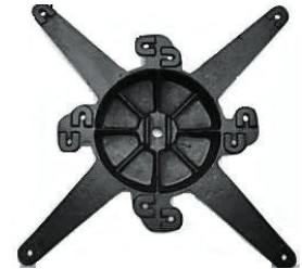
18" Top base