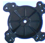
10" Top base